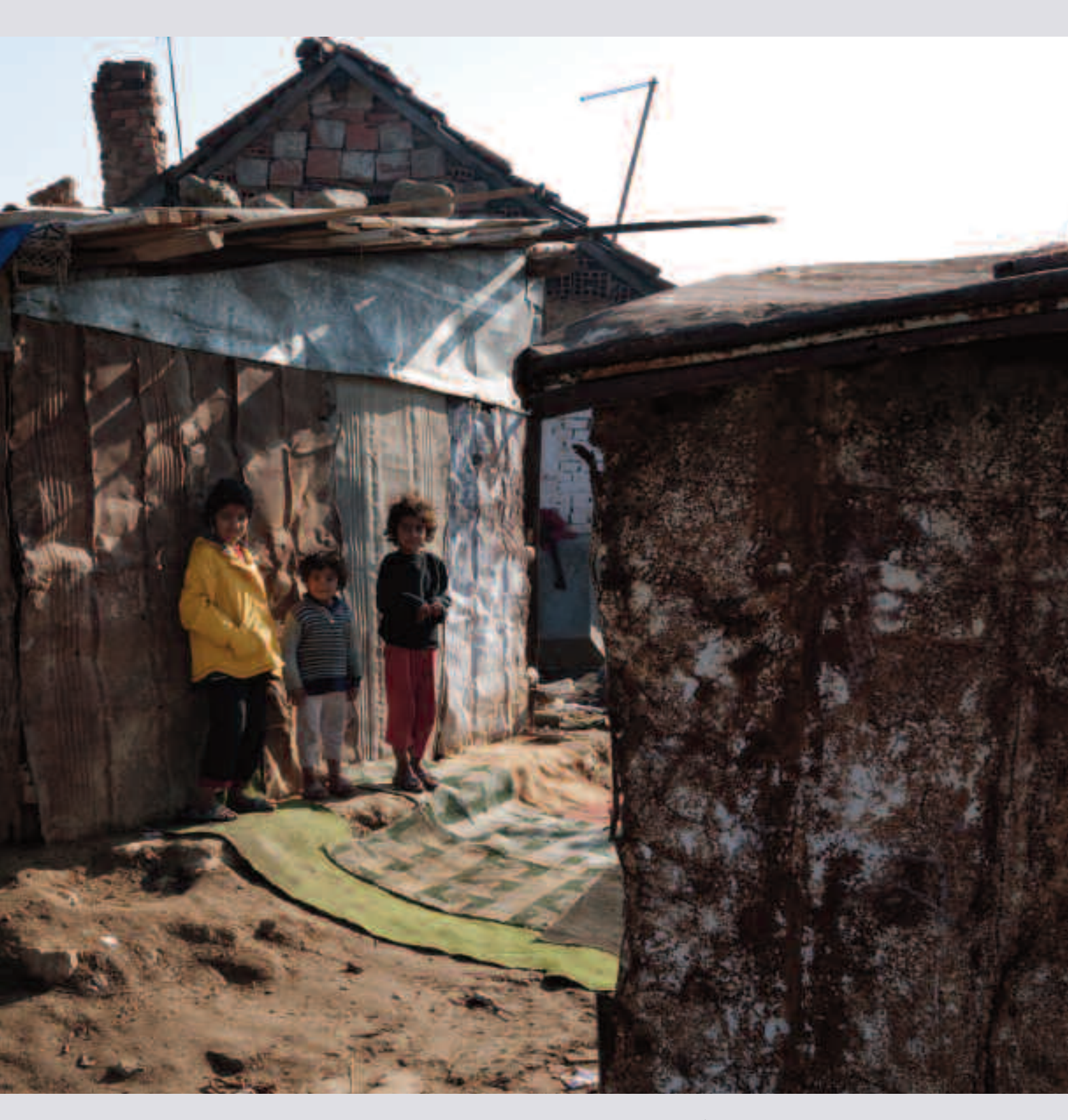
Dubrava area, Ferizaj/Urosevac town. This Roma neighborhood is extremely poor. None of the adults work and few children are able to attend school.